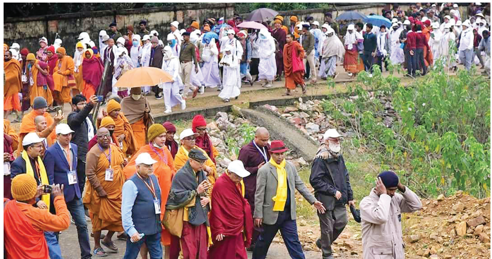
Monks and nuns from different countries and traditions alongwith many lay persons come together to retrace the footsteps of the Buddha from Jethian to Rajgir

A round 5,000 people including monks, nuns and laity participated in the International Dhamma Walk retracing the ancient route along the sacred 'Buddha-Path' from Jethian to Rajgir, in Nalanda district. The walk saw representatives of 15 countries take this spiritual pilgrimage, a distance of 15.5 km to reconnect with the Buddha. It was