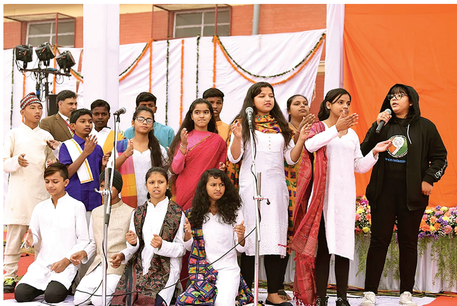
Students singing a self-composed fusion song.

Does me wrong by attacking or belittling me, I will take defeat upon myself, And give the victory to others. Even when someone I have helped, Or in whom I have placed great hopes Mistreats me very unjustly, I will view that person as a true spiritual teacher. In brief, directly or indirectly, I will offer help and happiness to all my mothers, And secretly take upon myself All their hurt and suffering. I will learn to keep all these practices