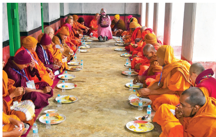
Monks and nuns being served food from Buddhist devotees at the Sanghadana