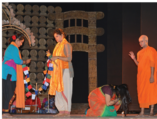
Buddha Pranam- A collage of Music, dance and theatre

Gautama Buddha and Swami Vivekananda – though they appeared at a gap of two thousand five hundred years – it is easy to identify them as similar and like-minded. The main purpose of their lives is the love for mankind. Vivekananda dedicated to Buddha a long poem titled NamoSambuddhao (Salutation to Buddha).