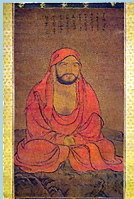
Bodhidharma in Japan