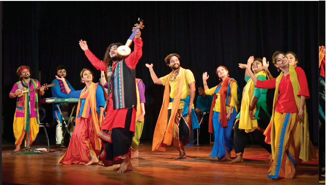
Rup Aruper Mayay is a presentation of the Mystic songs of Bengal Baul, Fakir, Kirtan in the Light of Charyapada.

A ttodeep, a social and research based NGO, recently showcased a cultural programme on the theme- 'Buddhism in Bengal', at the Nalanda Arts Festival (November 2019) organised by the Nava Nalanda Mahavihara (Deemed University) and the Eastern Zonal Cultural Centre to mark their foundation day.