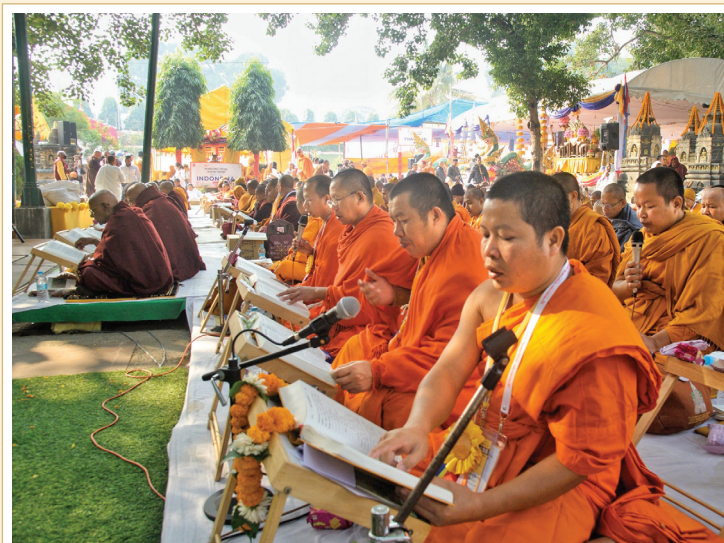
Monks from 11 countries took part in the chanting ceremony this year

Dedicated to reviving the Buddha Dharma in India, the LBDFI works to promote Buddhist pilgrimage, to develop the Buddhist Circuit, to educate monks and to support Buddhist publications.