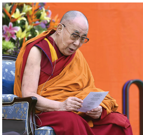
His Holiness the Dalai Lama reciting and explaining the Eight Verses on Training the Mind.

Left to one’s own devices, humans, as His Holiness explained, are very capable to do more good than harm but unfortunately, humans sometimes lack in using their intelligence. This failure to effectively use the intelligence in a constructive way paves way for