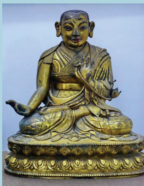
Bodhidharma in China

Dean, Centre of Indology, Bharatiya Vidya Bhavan, New Delhi