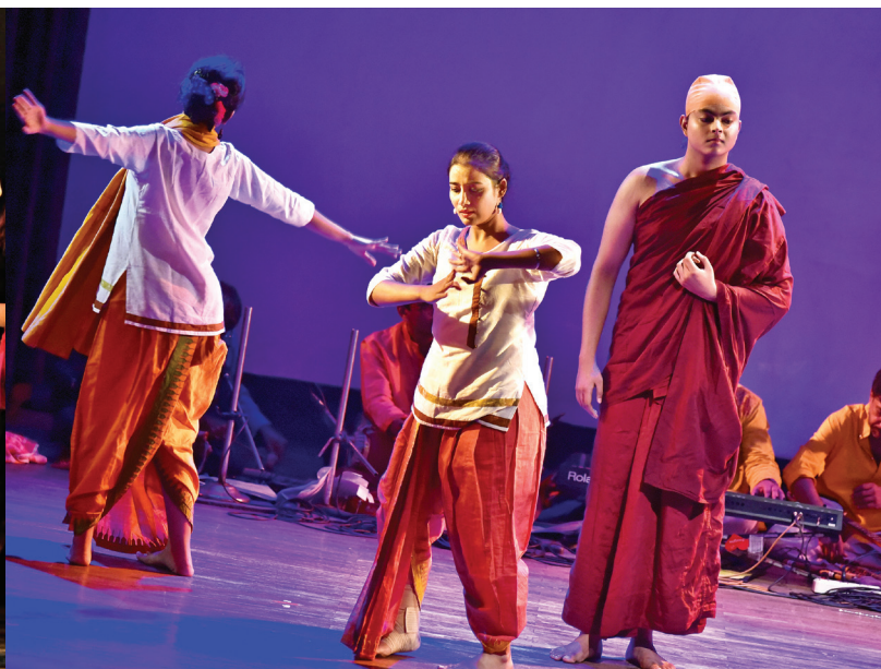
Attodeep presents a dance-theatre titled Aro Alo Asuk Prane or Let Your Inner Light Be Ignited based on the poems of Charyapada, Rabindranath, Vivekananda, Jibanananda and many others.

that the root of their songs belong to the most sophisticated and alluring form of Buddhism that is Vajrayana or Tantric Buddhism. So the Sufi or Darbeshi or Fakiri and the kawali songs of Bengal and most importantly the Kirtans , the Bauls songs with simple language and soulful music appeal to today's youth a lot. Also the dances based on these songs with deep insights and allegorical meanings can bring out the essence of Buddhism through the abstraction of the movements.