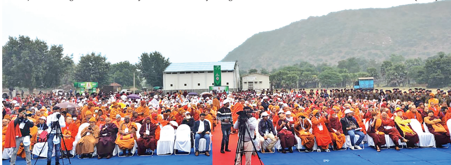
A view of the participants

Chinese monk-scholar Xuanzang (Hieun Tsang) mentioned an interesting legend where a man made a failed attempt to measure the height of the Buddha with a bamboo stick (latthi) and