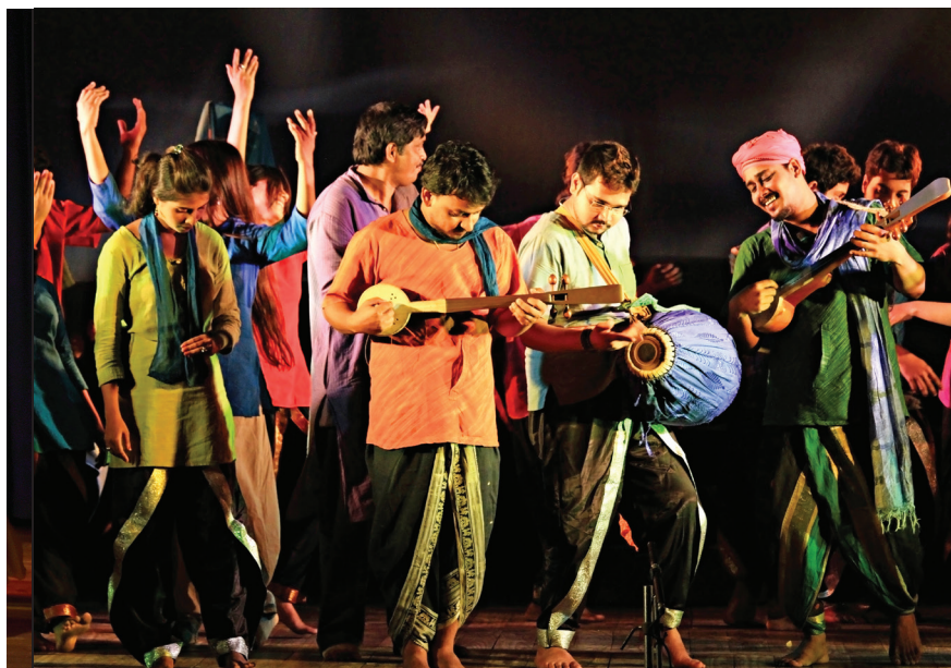
Rup - Aruper -Mayay- a presentation of the Mystic songs of Bengal with an insight of Vajrayana Buddhism