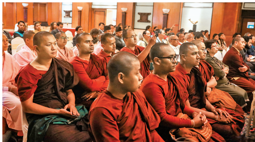
View of audience at the opening ceremony